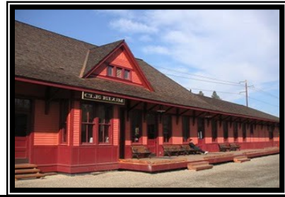
Can you identify where in Kittitas County this photo was taken? Answer on pg 4.